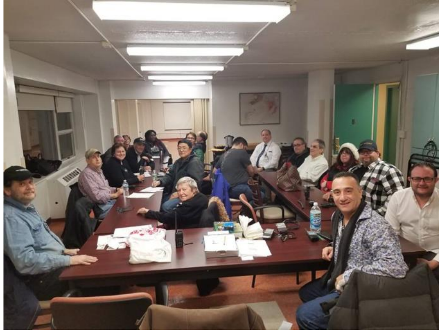
Just before the annual Holiday Part commenced!