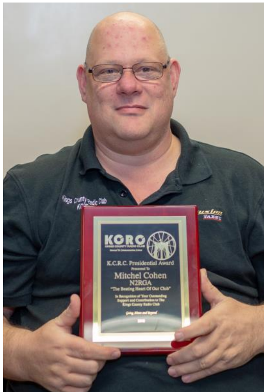
Our 2017-2018 President, with the plaque that he was awarded with at the Holiday Party!