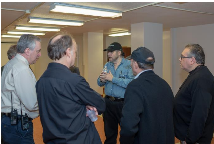
An impromptu segment of the KCRC Technical Net